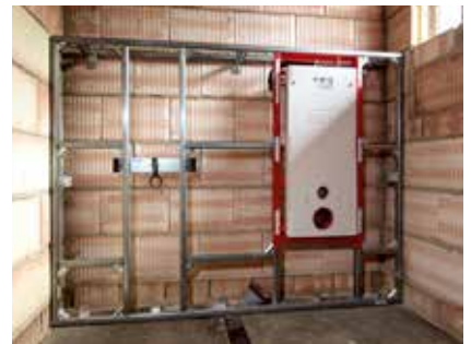
5. Assembled pre-wall, ready for panelling and tiling.

Visit us on our website at www.tece.com or get started right now at http://smartwall.tece.de !