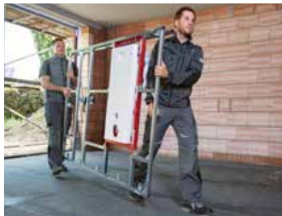
4. Delivery of the finished installation wall at the construction site