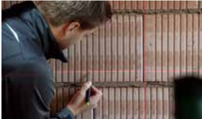
1. Measurement on the construction site

In an economical evaluation, pre-fabrication leads to a reduction of travel expenses and travel time and thus to greater efficiency in everyday work. Even the building client will welcome this mode of assembly because the construction process on the construction site is optimised – no matter whether it's a new building or renovation.