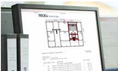
2. Planning with TECEsmartwall