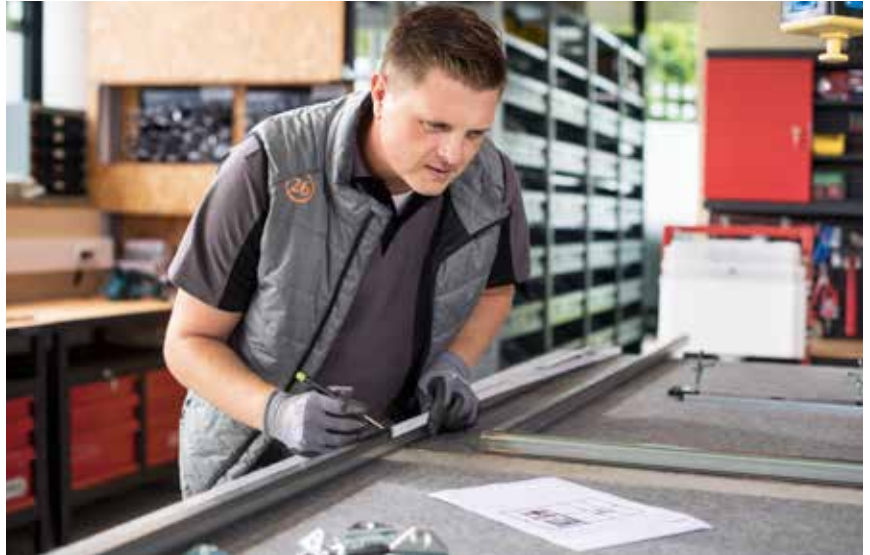
3. Prefabrication in the workshop