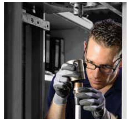
Preparation for tensile test