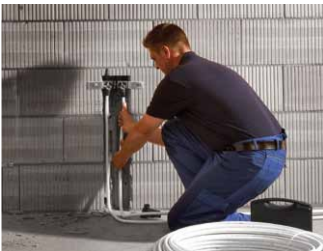
Installation in small space

What's heavier, a pressing tool or your hands? It's obvious: Things are easier if you only need your hands to carry out an installation. Especially if you are working overhead.