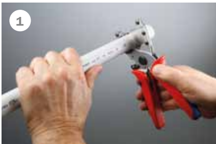
Cut to length

It's fast and easy to assemble the TECElogo professional system: (1) Cut to length, (2) Calibrate, (3) Push together, you're done.