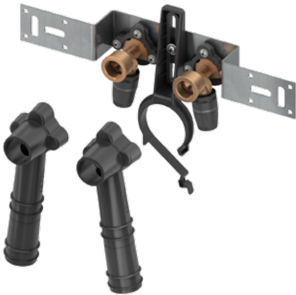
TECElogo assembly unit with sound-proofing elements