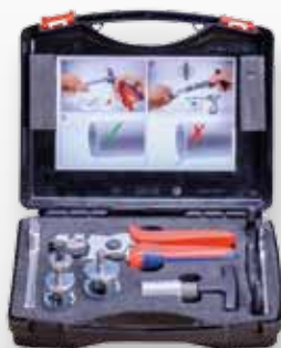
Pressing tool case 50 x 35 x 20 cm